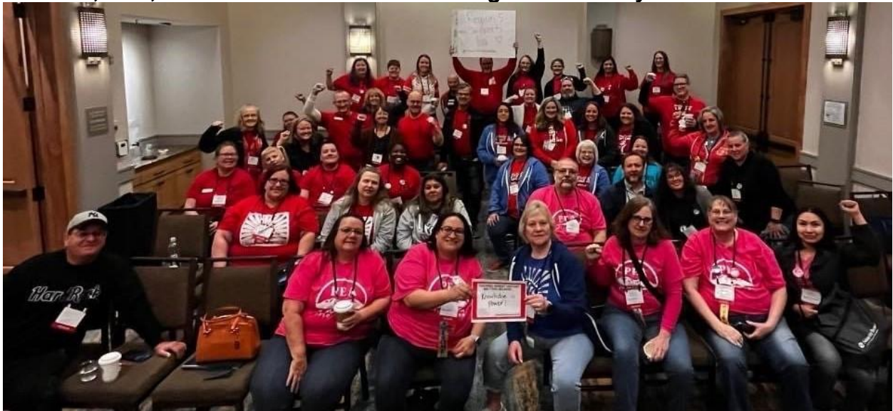
Region 5 Caucus (Southwest Colorado, including CSEA) at 2023 CEA DA